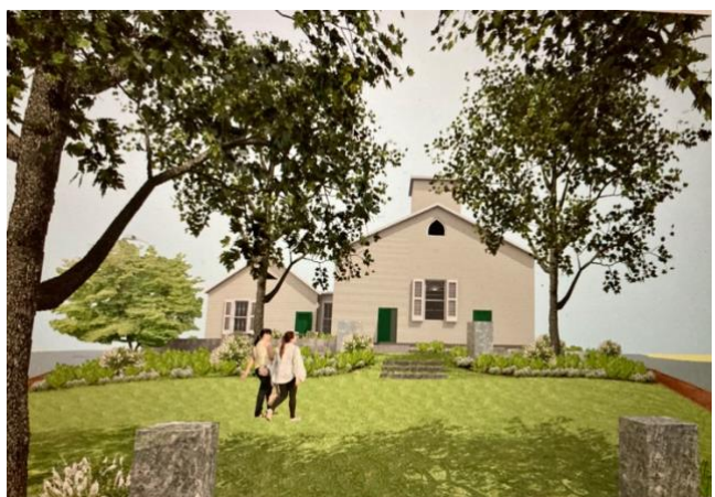
(A vision of the future, thanks to Pellettieri Associates)

You can help make all this possible with a generous contribution to MainStreet Warner, Inc. Thank you!